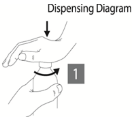
Fig. 1: The bottle comes with a child-proof cap