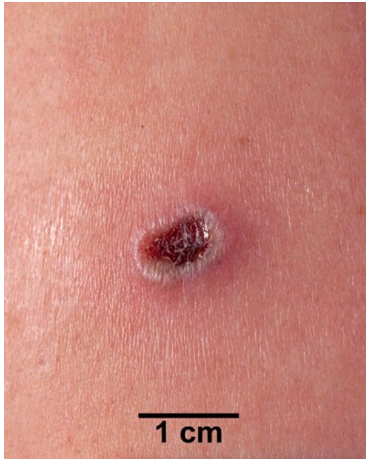
Day 10 (Primary vaccination)