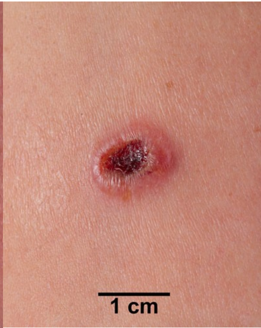
Day 14 (Primary vaccination)