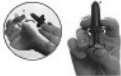
Figure 1A Figure 1B

Do not press the plunger until you have put the nozzle into your nostril or you will lose the dose.